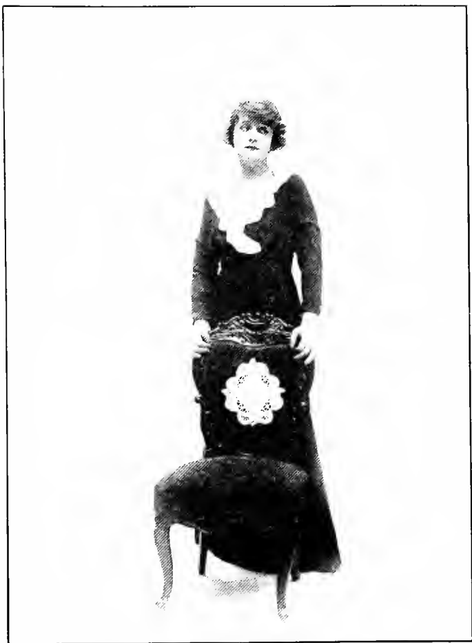
Nora made no reply to this affable speech.